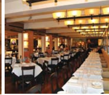
Maize restaurant & lounge (Left) Hotel Fitness Center (below)