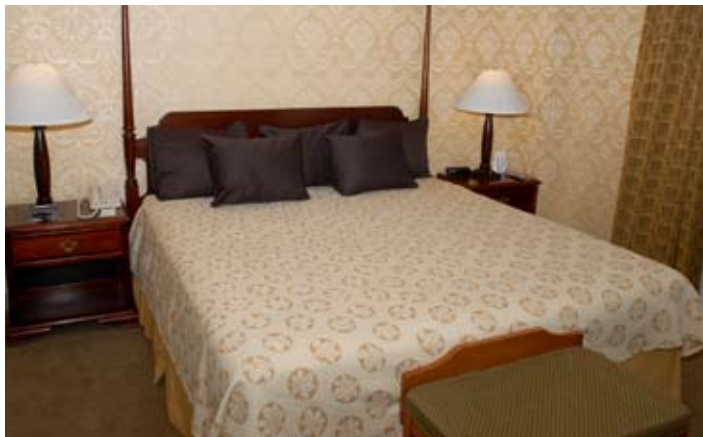
Each of the 3 Luxury Suites in the Hotel comes with updated bathrooms, a classically decorated Living Room and Bedroom.